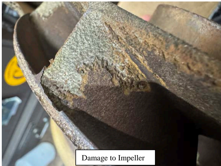
Damage to Impeller