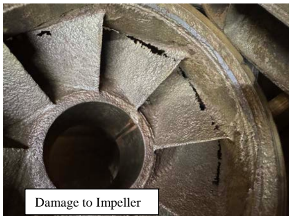
Damage to Impeller